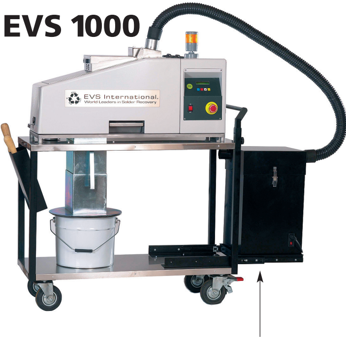
Pull out filter box for easy filter replacement