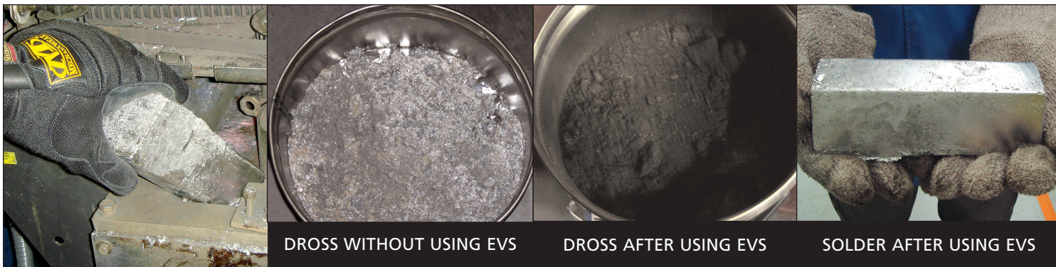
DROSS WITHOUT USING EVS

SUPPORT: EVS International supports its product through 24-hour availability of spares and service and by partnering with quality distributors who all have trained technicians and comprehensive spares stockholding.